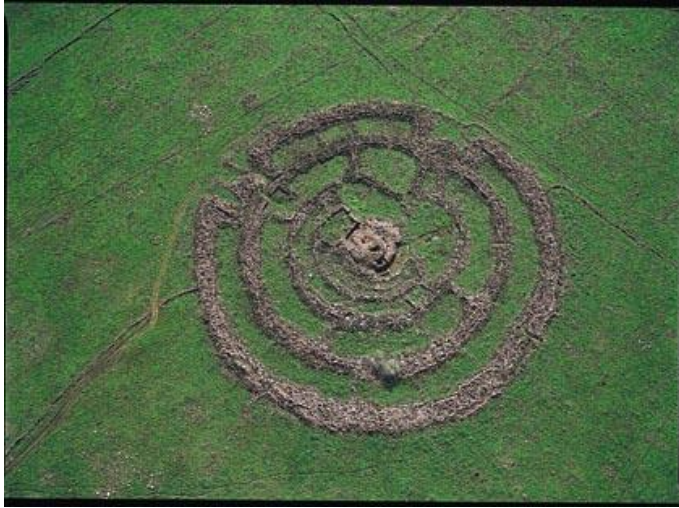
Rugum El Hiri (c.c tiuli)